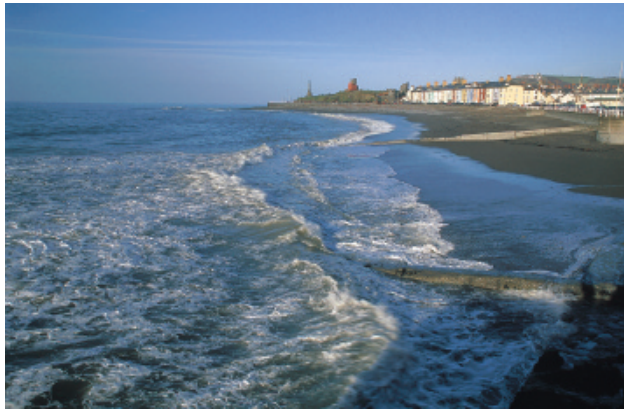
Seafront at Aberystwyth