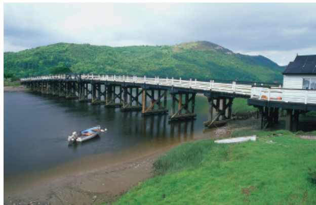
Toll bridge at Penmaenpool in the Mawddach Estuary